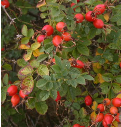
Fig 1 Plant features