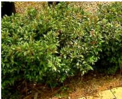
Fig 1 Growth form of Syzygium paniculatum