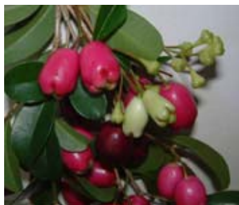
Fig 3. Fruit: Purple-red fruit is edible but not very tasty