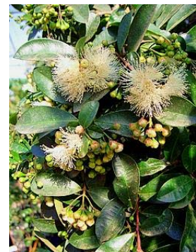
Fig 2. Plant features